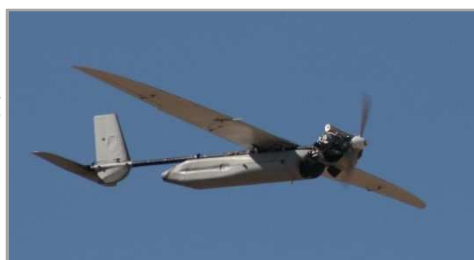
Fixed Wing UAV