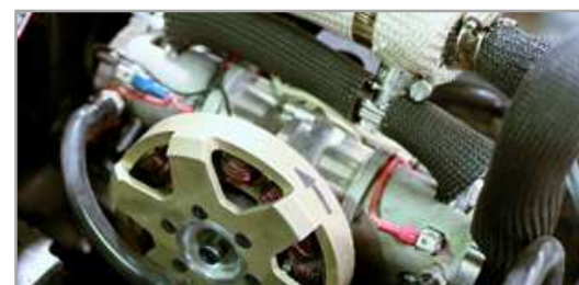
Marine Hybrid with Water Cooling